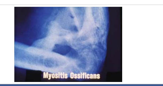
Figure 5: Loose bodies in the elbow.

McConnel states that the faulty position of the patella