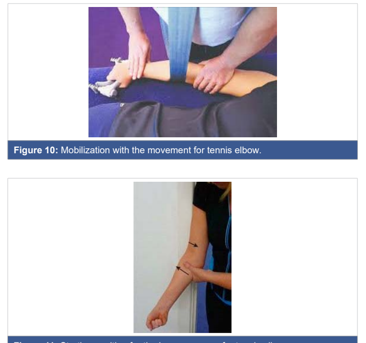
Figure 11: Starting position for the home program for tennis elbow.

The program in the clinic should be combined with a mobilization home program to be done daily in order to get long-lasting pain relief. Figure 11 illustrates the starting position for the home program.