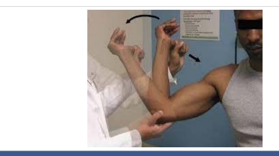
Figure 3: Valgus testing at the elbow.

The examiner must make a judgment as to which selective tissue tension tests are most painful. The passive or the resisted and then combine that information with history and inspection to reach a diagnosis.