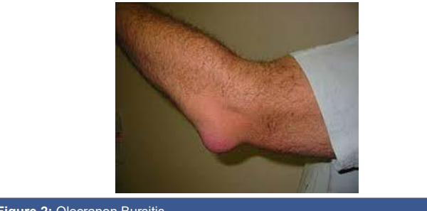
Figure 2: Olecranon Bursitis.