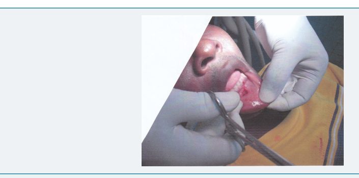
Figure 5: Clinical image of a perforation of the lower lip of the mouth after a fall.