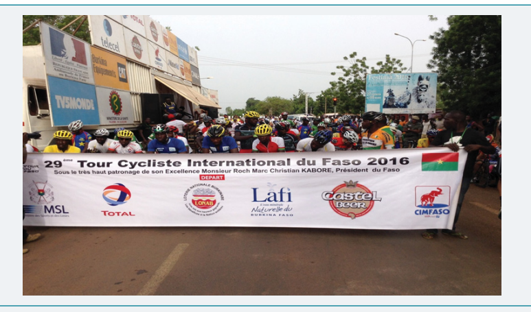
Figure 1: Photograph of the starting line of the 29th"Tour du Faso".

The 29<sup>th</sup> edition organized from 28 October to 06 November 2016 (Figure 1) was attended by 13 teams including 3 from Burkina Faso and 10 from the rest of Africa and Europe (Table 1). The competition consisted of 10 stages of online racing, a competition distance of 1337.1 km and 837.9 km of transshipment. The organization of the 29<sup>th</sup> International Cycling Tour of Burkina Faso was based on six commissions (technical, health, safety, logistics, accommodation, catering and press). The medical team consisted of two doctors and five nurses. Logistically there were three ambulances and a light car that gave care immediate care as it was at the level of runners. In cities where the caravan was to spend the night, a hotel room or tent (Figure 2) was reserved for use as a sick bed.