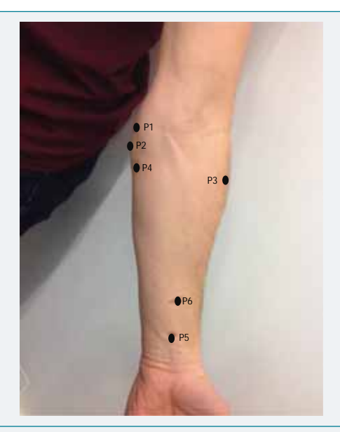
Figure 2: Location of measurements for pressure pain threshold and mechanical detection threshold. P1 = Point 1 - 1 cm above medial epicondyle; P2 = Point 2-1 cm under medial epicondyle; P3 = Point 3 - Muscle belly lateral lateral aspect of forearm in line with Point 4; P4 = Point 4 - Muscle belly medial - 6cm below medial epicondyle; P5 = Point 5 - Muscle tendons (fingers flexors) at middle of the forearm 4cm above Point 6; Point 6 - 1 cm above radial styloid process at middle of forearm.