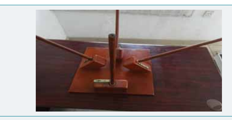
Figure 3: Four wooden poles, each having a length of 18 inches and a base of 3 inches that normally fit into the hole on the wooden block.