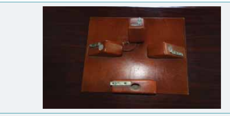
Figure 2: A square board measuring 16 by16 inches in length and width with 4 wooden blocks placed on each of the four sides. Each of the four wooden blocks has a hole in the upper one third that bears a wooden pole. Each of the wooden blocks is inclined at 600 to the floor of the wooden square.