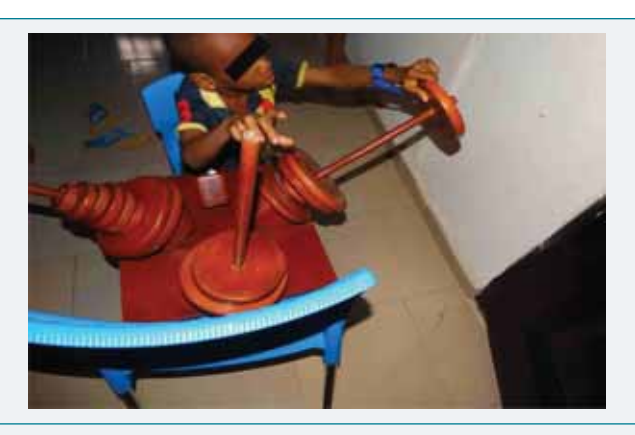
Figure 12: A Cerebral Palsy child in a Rehabilitation class using Dominic's Board.