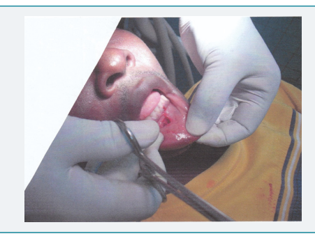
Figure 5: Clinical image of a perforation of the lower lip of the mouth after a fall.