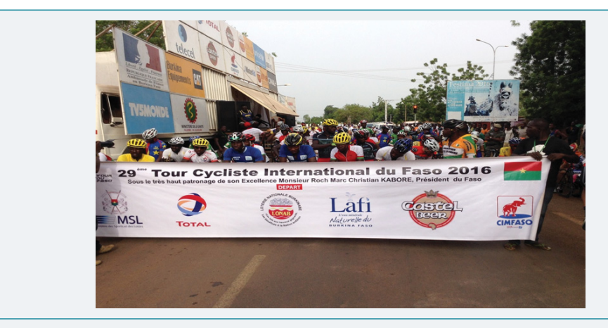
Figure 1: Photograph of the starting line of the 29th "Tour du Faso".

The 29<sup>th</sup> edition organized from 28 October to 06 November 2016 (Figure 1) was attended by 13 teams including 3 from Burkina Faso and 10 from the rest of Africa and Europe (Table 1). The competition consisted of 10 stages of online racing, a competition distance of 1337.1 km and 837.9 km of transshipment. The organization of the 29<sup>th</sup> International Cycling Tour of Burkina Faso was based on six commissions (technical, health, safety, logistics, accommodation, catering and press). The medical team consisted of two doctors and five nurses. Logistically there were three ambulances and a light car that gave care immediate care as it was at the level of runners. In cities where the caravan was to spend the night, a hotel room or tent (Figure 2) was reserved for use as a sick bed.