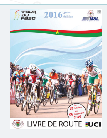
Figure 4: Photograph of the road book cover page.