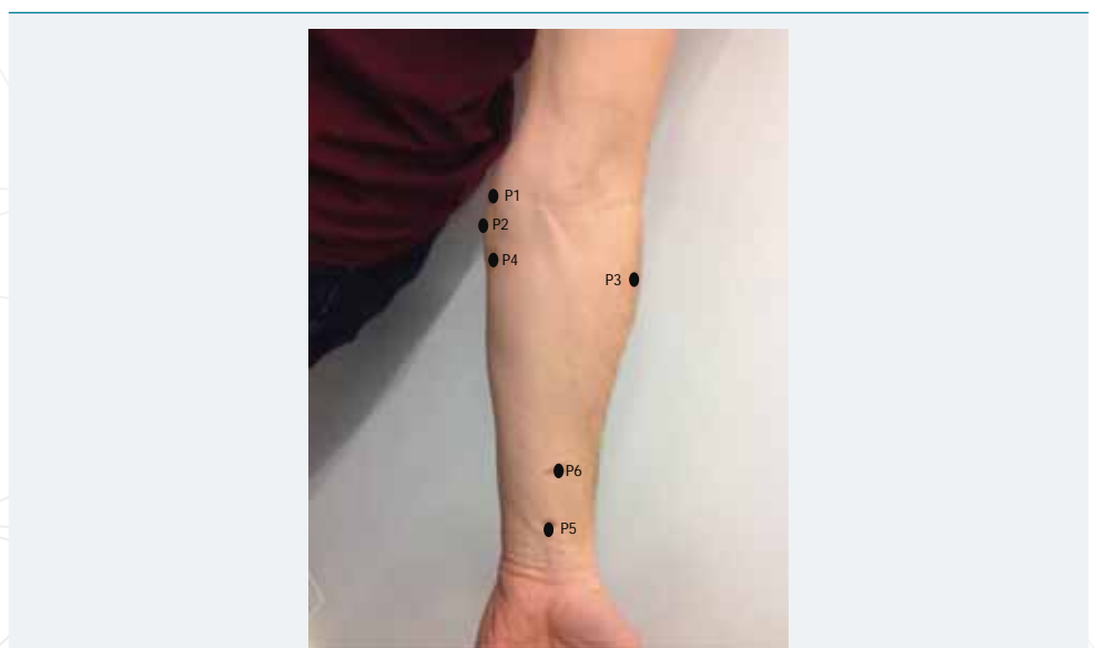
Figure 2: Location of measurements for pressure pain threshold and mechanical detection threshold. P1 = Point 1 - 1 cm above medial epicondyle; P2 = Point 2-1 cm under medial epicondyle; P3 = Point 3 - Muscle belly lateral - lateral aspect of forearm in line with Point 4; P4 = Point 4 - Muscle belly medial - 6cm below medial epicondyle; P5 = Point 5 - Muscle tendons (fingers flexors) at middle of the forearm 4cm above Point 6; Point 6 - 1 cm above radial styloid process at middle of forearm.